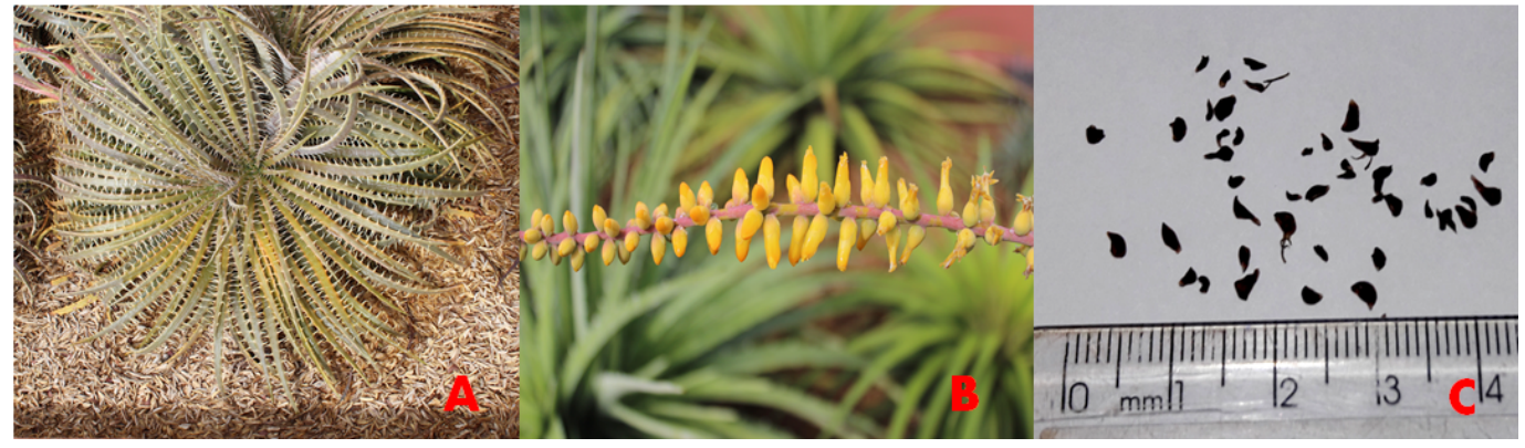
Figure 2. Aspects of the plant (A), inflorescence (B) and seeds (C) of Dyckia delicata.

by the tetrazolium test, both following the Brazilian Rules for Seed Testing (Brazil, 2009).