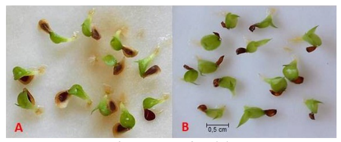
Figure 4. Seedlings of Dyckia brevifolia (A) and Dyckia delicata (B) after 30 days in a germination chamber observed in the control treatment.

The low free-water content in the seeds was essential in avoiding the formation of intracellular ice crystals during the freezing, which could cause the endomembrane system to rupture and result in losing both the semipermeability and the cell compartmentalization (Kaviani et al., 2009). Moreover, the seeds, especially orthodox ones, have protective mechanisms capable of maintaining cell membrane