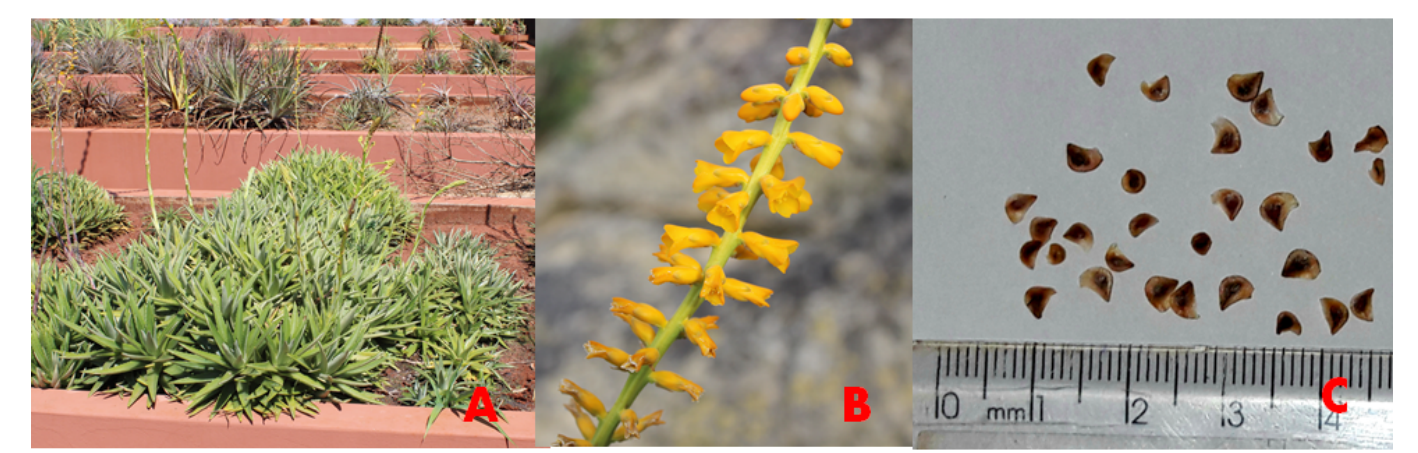
Figure 1. Aspects of the plant (A), inflorescence (B) and seeds (C) of Dyckia brevifolia.

The seeds were manually extracted from mature capsules and stored inside Kraft paper bags at 10 \pm 2 °C, for two weeks. For the characterizing the lot, the water content of the seeds was determined after their collection, as well as their viability