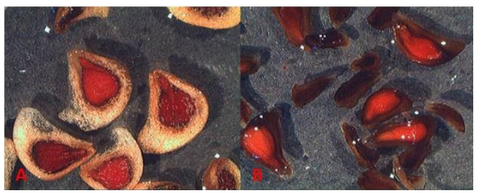
Figure 3. Seeds of Dyckia brevifolia (A) and Dyckia delicata (B) subjected to the test before the cryopreservation in liquid nitrogen.

No influence of the treatments used was found in relation to the percentage of abnormal seedlings (AS), length (L)